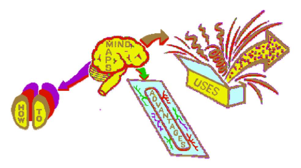
Fig 2: Mind Maps

According to Peterusell.com "Mind maps were developed in the late 60s by Tony Buzan as a way of helping students make notes that used only key words and images. They are much quicker to make, and because of their visual quality much easier to remember and review."